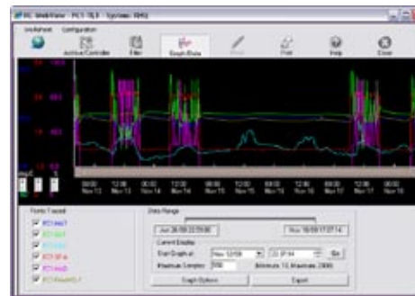
Trend Log in Browser