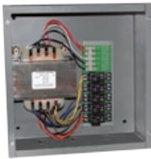
Shown Without Cover

Temperature Derating: 4A up to 40° C ; 3A up to 50° C ; 2A up to 55° C (When All 5 Outputs Operated Simultaneously)