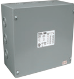
Shown With Cover