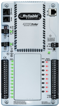
2 MACH-ProSys™ controllers