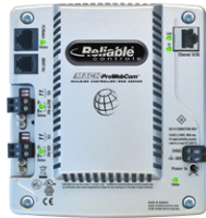
1 MACH-ProWebCom™ controller