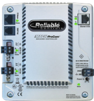
2 MACH-ProCom™ controllers