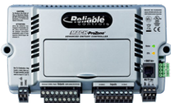
19 MACH-ProZone™ controllers