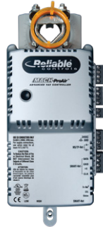
126 MACH-ProAir™ controllers