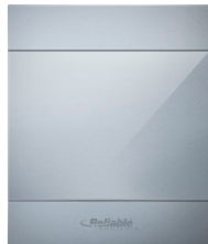
5 MACH-ProView™ controllers