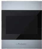
2 MACH-ProView™ LCD with Router controllers