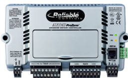
69 MACH-ProZone™ controllers