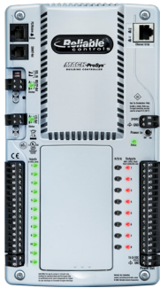
7 MACH-ProSys™ controllers