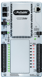
5 MACH-ProSys™ controllers