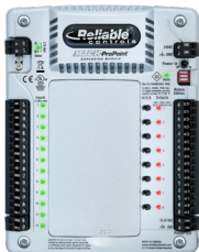
14 MACH-ProPoint™ expansion modules