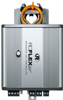
62 RC-FLEXair™ controllers