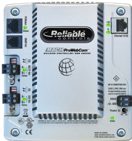
1 MACH-ProWebCom™ controller