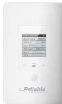
25 SMART-Sensor™ EPD devices

A MACH-ProWebSys controller provides a web-based interactive platform that allows building operators to access the new control system easily and efficiently over the internet. No larger than a typical controller, the MACH-ProWebSys combines a BACnet Building Controller, BACnet Operator Workstation, and powerful web server in a single package that reduces capital expenditures by eliminating the need for workstation client software, license renewals, and fees for cloud services. For controlling large rooftop and midsize mechanical room equipment, Advanced Construction Technologies installed two MACH-Pro2 controllers, each a rugged, flexible, fully programmable BACnet Building Controller.