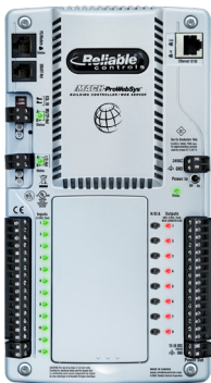
1 MACH-ProWebSys™ controller