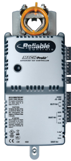
25 MACH-ProAir™ controllers