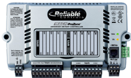
5 MACH-ProZone™ controllers