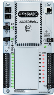
1 MACH-ProWebSys™ controller