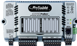
17 MACH-ProZone™ controllers