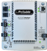
1 MACH-ProCom™ controller