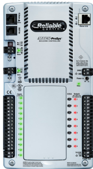
7 MACH-ProSys™ controllers