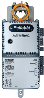
11 MACH-ProAir™ controllers