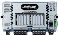
125 MACH-ProZone™ controllers