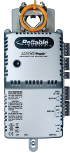
45 MACH-ProAir™ controllers