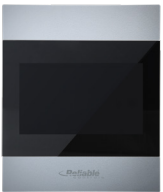
16 MACH-ProView™ LCD with Router controllers