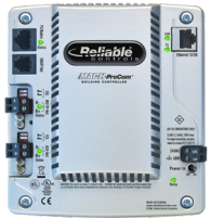
10 MACH-ProCom™ controllers