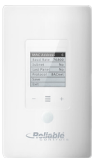
52 SMART-Sensor™ EPD devices

Interested in Reliable Controls technology for your next project?