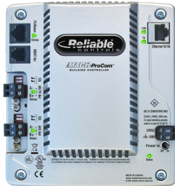
1 MACH-ProCom™ controller