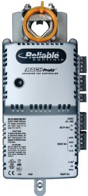
49 MACH-ProAir™ controllers