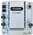
2 MACH-ProCom™ controllers