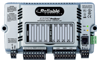
7 MACH-ProZone™ controllers

Building Management Systems carefully designed the control system to achieve the following sustainability goals: