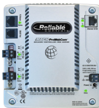
2 MACH-ProWebCom™ controllers

Interested in Reliable Controls technology for your next project?