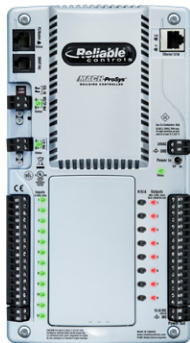
2 MACH-ProSys™ controllers