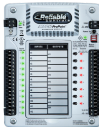
12 MACH-ProPoint™ Input/Output expansion modules