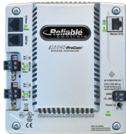
1 MACH-ProCom™ controller