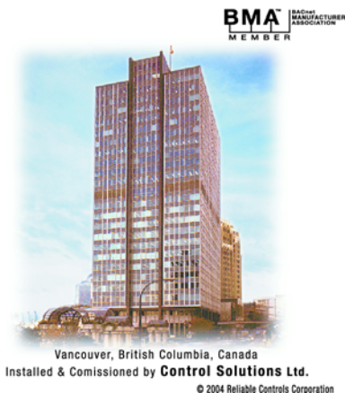
Vancouver, British Columbia, Canada Installed & Comissioned by Control Solutions Ltd.

The Reliable Controls® MACH-System™ installed at the Guinness Tower consists of over 1,500 points of measurement and control.