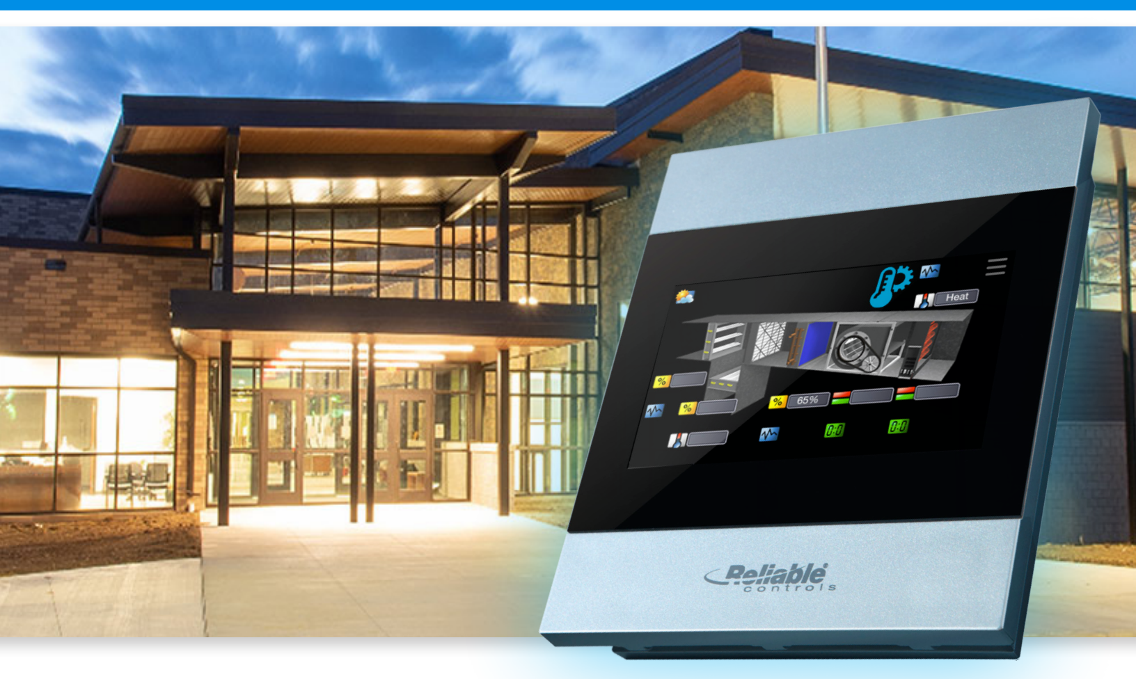
MACH-ProView™ LCD building controller

People and technology you can rely on<sup>™</sup>