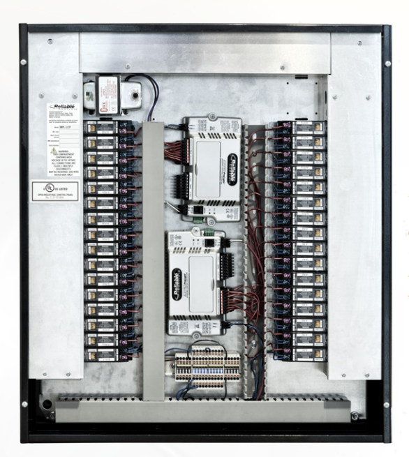
MACH-ProLight Lighting Control Panel (MPL-LCP-32)

Easily integrate a host of wireless EnOcean peripheral devices into a Reliable Controls system using the MACH-ProLight advanced lighting controller.