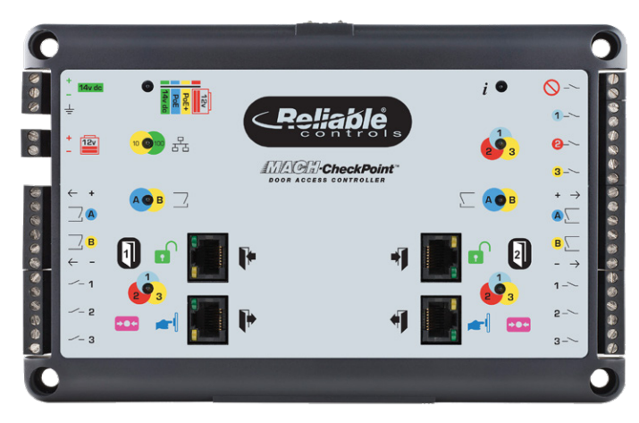
MACH-CheckPoint door-access controller